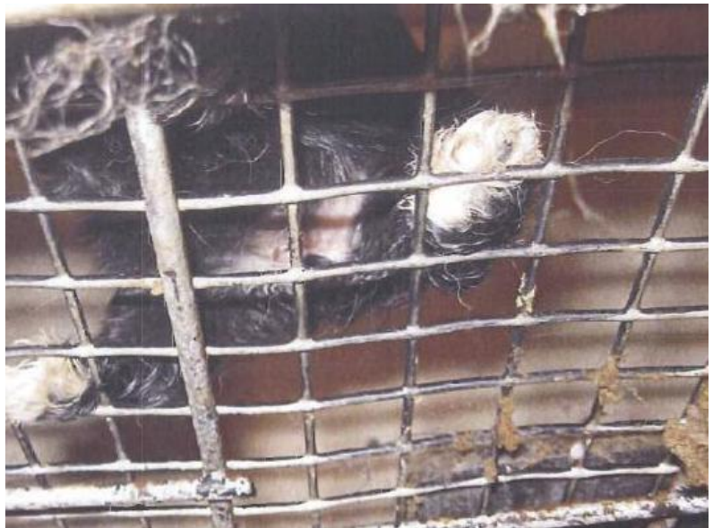
Below: A puppy's feet are shown from below as her paws straddle dirty, feces-laden wire floors at S&S Family Puppies. 2008