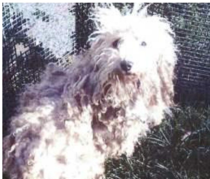
A photo obtained from USDA enforcement records shows a thin, dirty and matted dog at S&S Family Puppies in Milan, MO. 2008/ USDA

This update follows some of those kennels to see whether they are still licensed in 2011. As detailed in this report, the majority of the "Dirty Dozen" kennels are still state-licensed to this day, indicating the ongoing need for the protections that Proposition B, The Puppy Mill Cruelty Prevention Act, will provide.