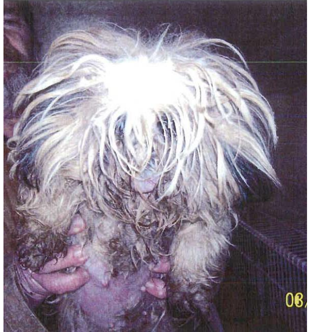
Above: A photo from USDA enforcement records shows a dog at S&S Family Puppies so badly matted that it's difficult to guess what breed she is. It appears difficult for the dog to see.

USDA inspection reports detail repeated Animal Welfare Act violations for dogs exposed to the freezing cold without adequate weather protection, problems with seriously ill, injured or malnourished dogs not being treated by a vet, housing problems, filthy, feces-laden conditions and more.