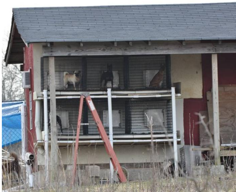
Dogs in small cages at the “Tiny Tails” facility in Edgar Springs likely never set foot on the spacious grounds.