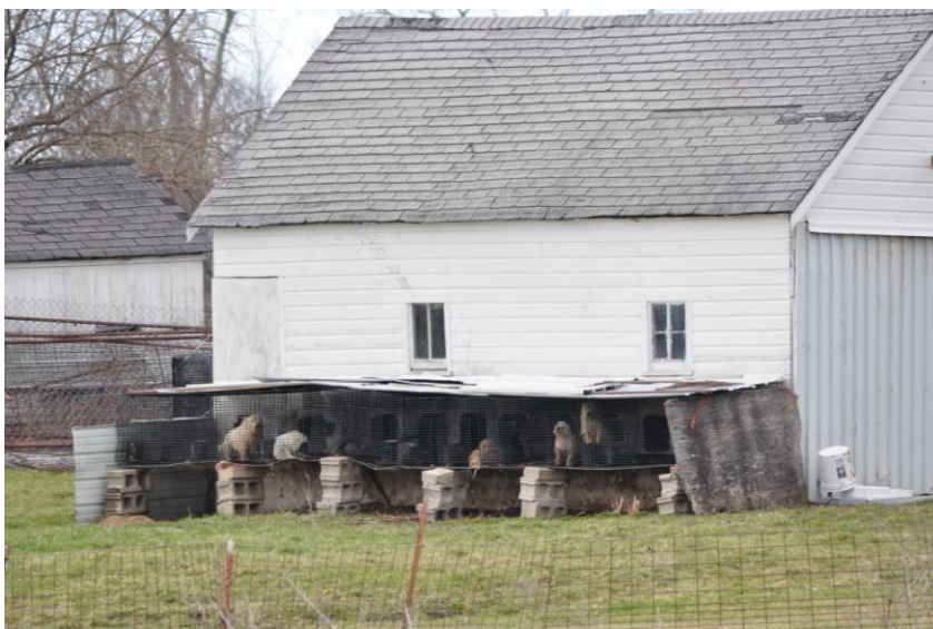
Crooked, rusty cages at B & B Kennel appear to be propped up with cinderblocks. 2010/The HSUS

Fields, an early contributor to MoFed PAC, a group that opposed Prop B, had good reason to fear better oversight of the kennel industry. Her record includes a long list of violations for inadequate veterinary care and dogs with inadequate protection from the cold, including some found outside in temperatures as low as 9 degrees, according to federal and state inspection reports. Serious care violations included dogs with untreated injuries, oozing sores, inadequate space, dogs caked in feces, and many violations for housing in severe disrepair and sanitation problems.