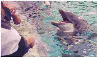
This obese dolphin has apparently succeeded in competing with other Petting Pool dolphins for fish provided by visitors.