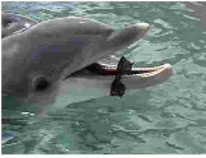
Sunglasses are common trouble items at Petting Pools.