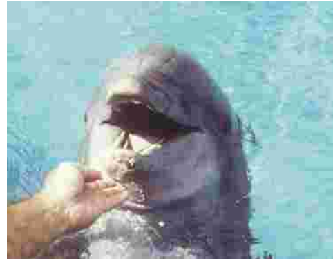
The laceration to the lower tip of this dolphin's jaw is exposed to a visitor's touch.

members of the public can participate in a Petting Pool feeding session than a SWTD session and, although visitors are not in the water with the dolphins in Petting Pools, they may have at least as much hands-on contact with the animals. We therefore believe that the ratio of staff to visitors at Petting Pools needs to be at least equivalent to the former SWTD requirements - to ensure control over the nature and extent of interactions between visitors and the dolphins and the safety of both parties.