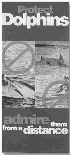
The US government has launched a public campaign to deter feeding, touching and swimming with dolphins in the wild.