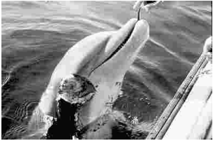
This wild dolphin, which was routinely fed by people, has injuries around its eye and throat.