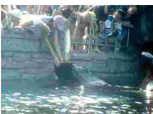
Orcas, too, can be subject to petting in public display facilities.

no alternative but to bring this issue to the attention of the public, the media and the travel and insurance industries. We encourage each to respond responsibly to the information provided.