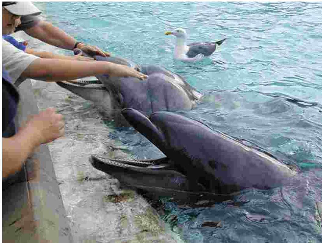
Several Petting Pool dolphins are obese, despite a legal obligation to adjust captive dolphins' food intake to ensure a "normal state of good health".

As Sea World explains on its website, its trainers use food as a 'primary reinforcer' to let an animal know when it has performed a desired behavior. In the case of unwanted behavior, the trainer remains motionless and silent for three seconds. But as the site acknowledges, "Because we really don't