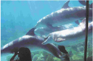
Even in 'refuge areas', underwater viewing walls ensure that the dolphins are never far from the sight or sounds of visitors.