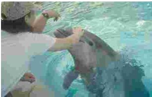
ABOVE AND BELOW: Begging for attention at a typical Petting Pool interaction.