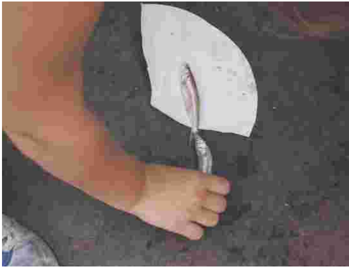
LEFT: Visitors have been observed feeding the dolphins with fish that have been dropped and stepped on.