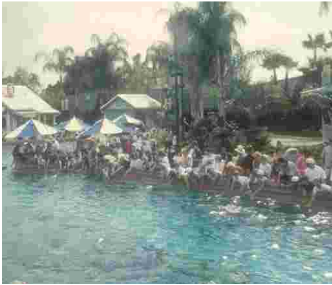
RIGHT: During the busiest times at a Petting Pool, seemingly hundreds of people can almost entirely surround a dolphin pool.