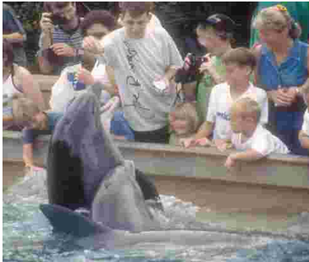
Because of the sheer size of dolphins competing for fish in a Petting Pool, their abrupt movements in a confined area may put visitors at risk of harm.

Although many public display facilities endeavor to breed cetaceans, significant numbers of whales and dolphins continue to be taken from wild populations to supply the growing demands of the captivity industry and to compensate for the premature deaths it causes in many facilities. Methods used to capture and transport cetaceans can be shockingly cruel, and many individuals die during capture operations or in transit. Although the capture of wild cetaceans from US waters is currently prohibited (except under special permit), wild cetaceans continue to be captured by and traded between many other countries and may ultimately be imported into the US. Records show that Sea World displays dolphins captured from the wild as well as those born in captivity.