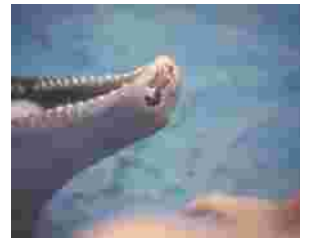
LEFT AND ABOVE: Evidence of injuries, both new and old, can be found in Petting Pool dolphins.

San Diego Petting Pool in September 2001 acknowledged to a WDCS observer that visitors regularly drop personal items, such as keys and sunglasses, into the pool, which must be retrieved to avoid harm to the dolphins. Pool-bottom inspections during opening hours were not observed by investigators before 2001, and may have been initiated in response to our 1999 report to APHIS, which included a report of a calf at Sea World San Diego picking up a coin from the bottom of the pool. Although these inspections are a welcome development, we remain concerned that they do not address the problem of visitors feeding foreign objects directly to the dolphins.