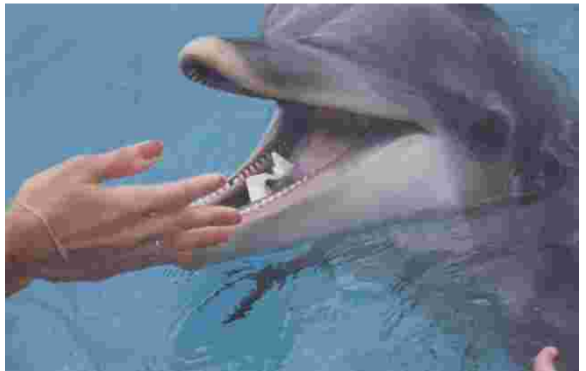
Paper fish containers are among the common items found in the mouths of Petting Pool dolphins.

A Sea World staff member supervising an underwater inspection of the bottom of the