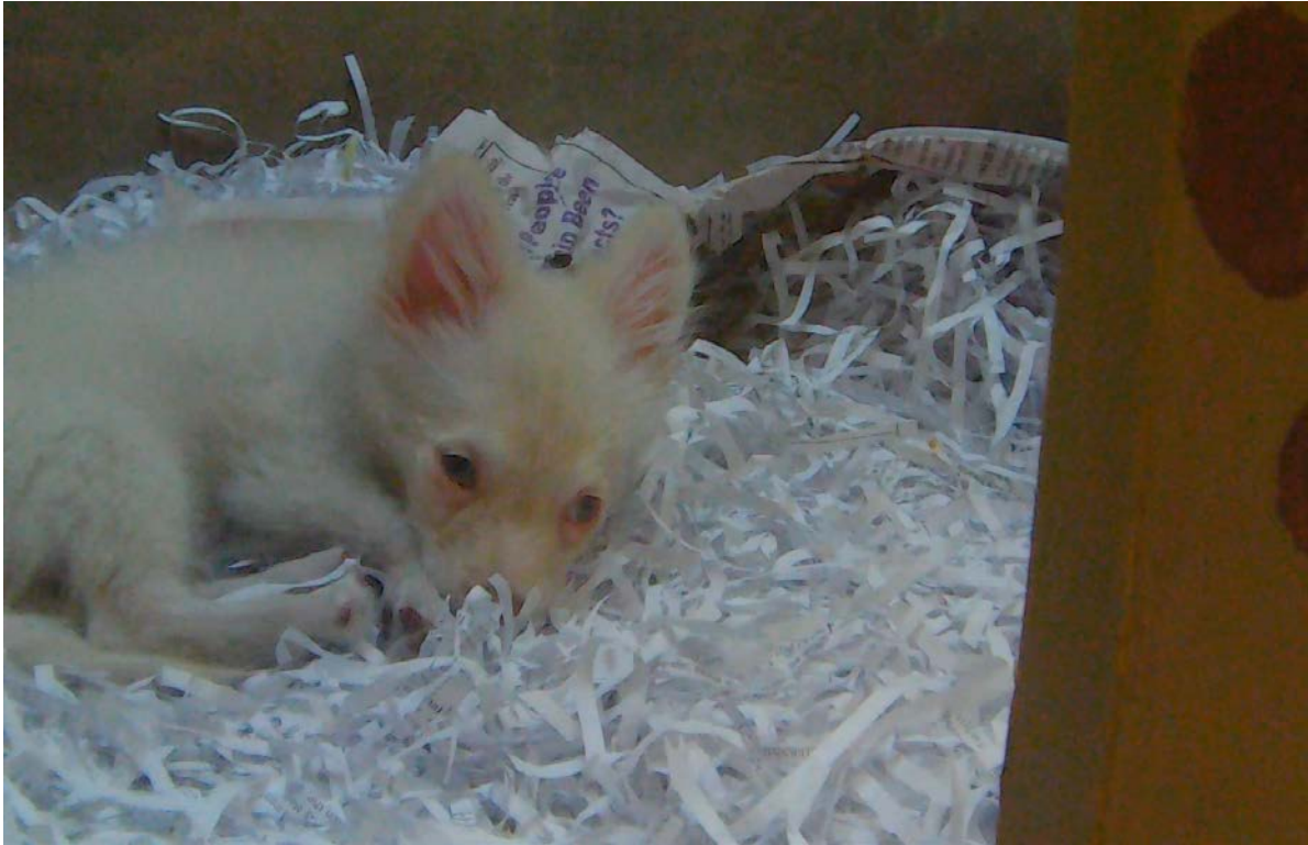
Pets & Pals refused to give breeder information on this ill-looking puppy.