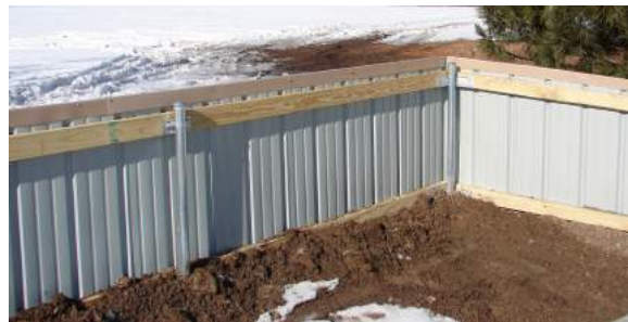
Prairie dog side of barrier. Note safe caps on metal posts and elongated cap along top of metal fencing.