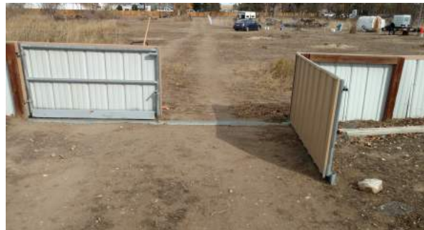
Gate for vehicle access. Culvert pipe blocks light.