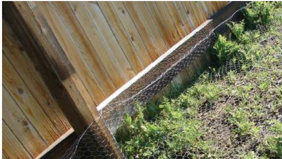
C. Skirting attached to prairie dog side of fence.