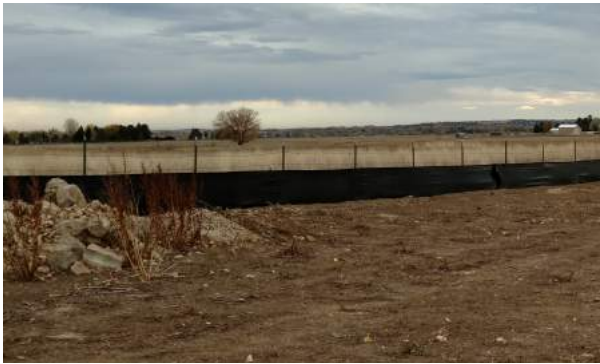
Silt fence used in large field.