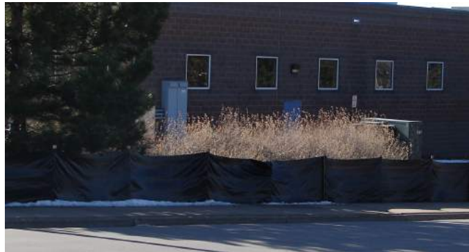
Silt fence used for pending construction.