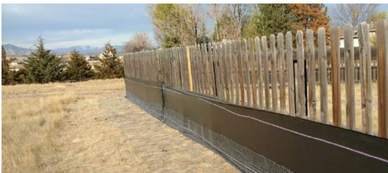
Modified to exclude prairie dogs by adding black silt fence and skirting.