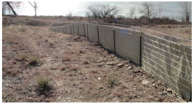
Non-prairie dog side