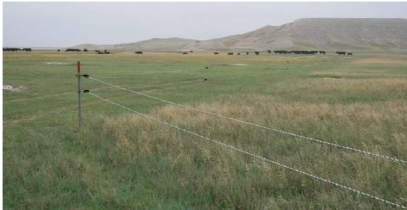
Using electric fence to prevent cattle grazing works well to create a vegetation buffer.

Manipulation of vegetation can direct prairie dog expansion and contraction. During high precipitation years, when grasses and plants grow well, prairie dog colonies contract. Drought conditions create the opposite situation, causing prairie dog colonies to expand. If prairie dogs are not desired in an area, avoid clearing shrubs and mowing, at least through late spring and/or early summer (when the highest rate of prairie dog dispersal is likely to occur, depending on prairie dog species).