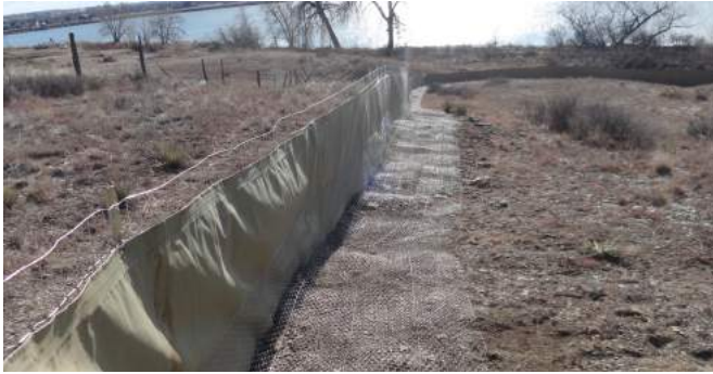
Prairie dog side

A 42-inch-wide vinyl barrier was trenched 6" into the ground and attached to 2-inch by 1-inch by 4-foot-tall welded wire for structural support (attached to 5-foot T-posts every 10 to 15 feet). There is also 4- to 5-foot wide one-inch netting poultry skirting installed on the prairie dog side. Poultry wire was held up vertically by thin-gauge wire inserted through the vinyl and attached to the T-post.