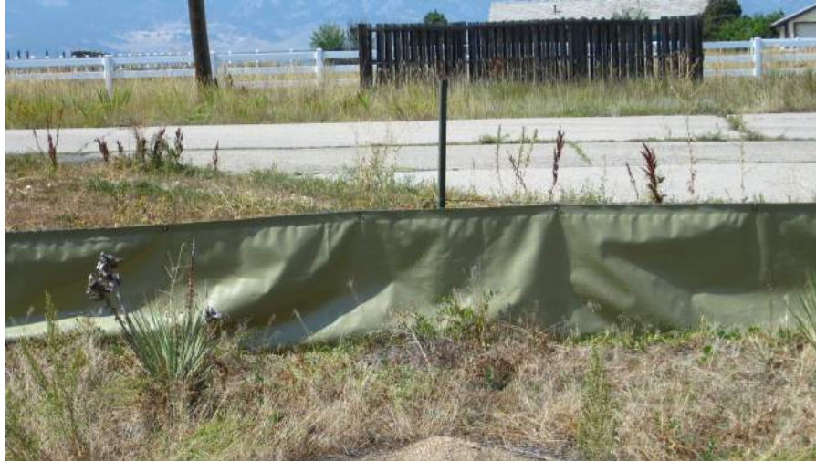
Flawed vinyl barrier installation.