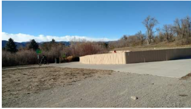
Metal barrier at park separates human and prairie dog activities.

Metal barriers are made from metal sheeting (for example Pro-panel) and are typically trenched 2 to 4 feet underground.