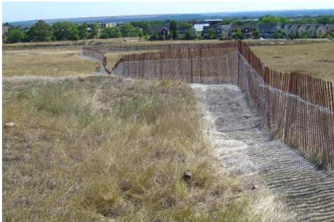
Prairie dog side

The area pictured below needed a temporary fence that could withstand winds. To prevent prairie dogs from breaching the fence, poultry wire skirting was added with an unsecured one-foot “flop” at the top edge to discourage prairie dogs from climbing over.