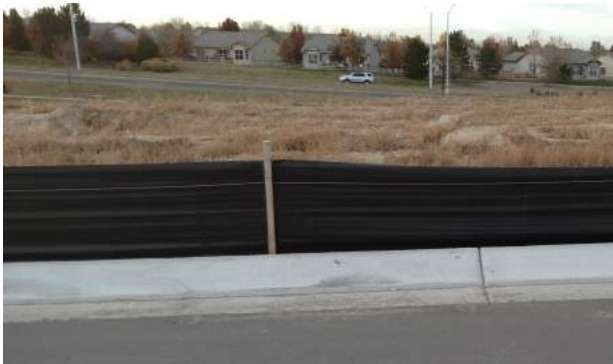
Silt fence with stakes and staples exposed.

There are pros and cons to silt fence and opportunities for modifications. Advantages: the fence is easy to find in most hardware stores and installation is not too difficult. Disadvantages: wind can rip the fabric out of the staples and over long periods of time prairie dogs may try to chew through the barrier. The modifications shown in the photos below will help with longevity.