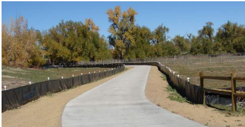
Temporary vinyl barrier used during construction project.

Vinyl was trenched into the ground and held up by T-posts and smooth wire running through the top grommets. This project involved using non-lethal passive relocation methods to move prairie dogs out of the way of a large concrete path and trail installation. Once the project was completed, the barrier was removed.