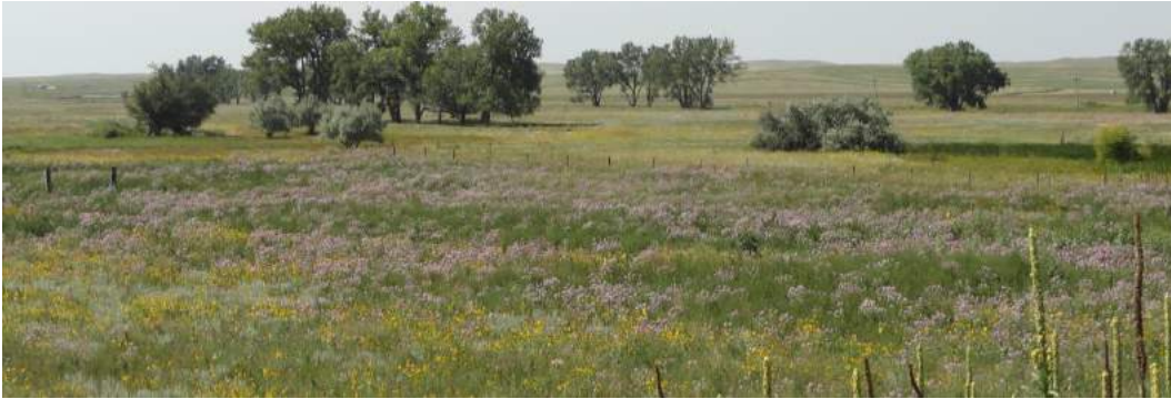
Mixing forb species (such as sunflowers and Rocky Mountain bee plant (prairie dogs have a tendency to avoid both forb species)) with grasses increases plant diversity and lengthens the seasonal effectiveness of the vegetation barrier.