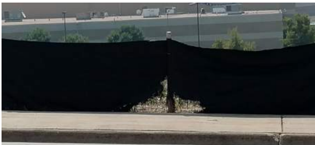
Prairie dogs have chewed through the fence.