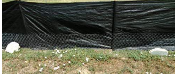
Modification: Using 2 foot-wide one-inch netting poultry wire, lip one foot vertically and use a staple gun to attach to wood posts. Anchor horizontal piece to ground with 6-inch pins.