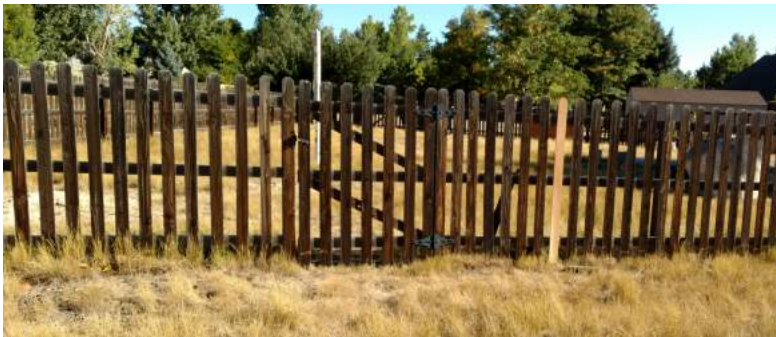
Existing fence before modifications.

Note: this is not a permanent solution but was used given limited funds and unknown future land use.