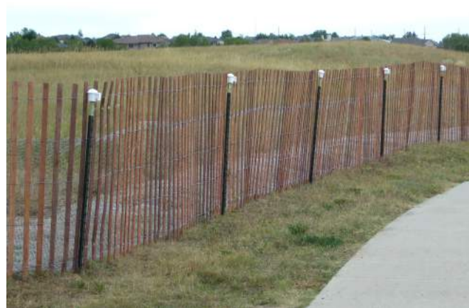
Non-prairie dog side