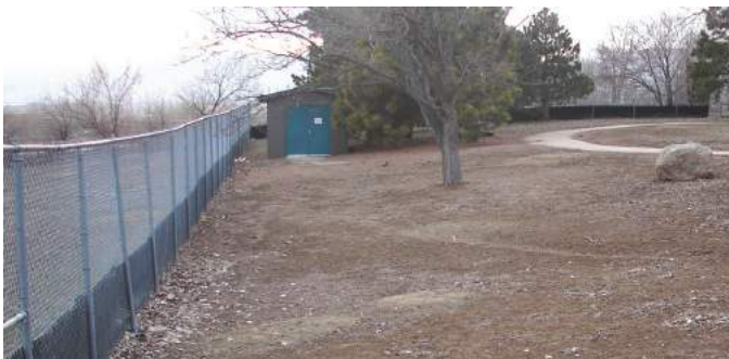
Prairie dogs non-lethally removed from developed park (non-prairie dog side).

On the prairie dog side of fence, use 5-foot wide one-inch netting poultry wire, Attach one foot of wire vertically to the chain-link and anchor remaining 4 feet to the ground using 6-inch sod pins. Using 36” wide vinyl barrier, attach top grommets to fence with clips or use smooth wire to weave grommets into fence links. Anchor bottom grommets by inserting two 11-inch edging pins per grommet into the ground.