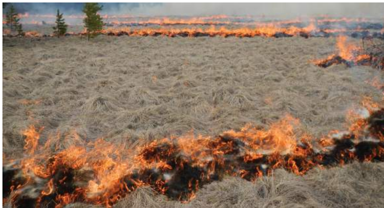
In areas where prairie dog expansion is desired, controlled burns, increased livestock grazing, and mowing are effective in creating inviting habitat.

Manipulation of vegetation can direct prairie dog expansion and contraction. During high precipitation years, when grasses and plants grow well, prairie dog colonies contract. Drought conditions create the opposite situation, causing prairie dog colonies to expand. If prairie dogs are not desired in an area, avoid clearing shrubs and mowing, at least through late spring and/or early summer (when the highest rate of prairie dog dispersal is likely to occur, depending on prairie dog species).