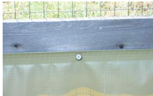
Screw and washer through grommet