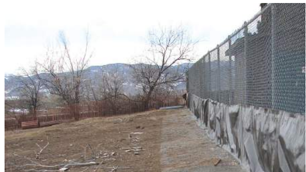
Modified existing chain-link fence to inhibit movement back into park (prairie dog side).