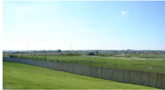
B. Non-prairie dog side.