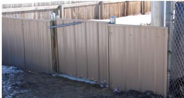
Self-closing swing gate for pedestrians (springs on each side of gate). Metal culvert pipe at threshold blocks light.