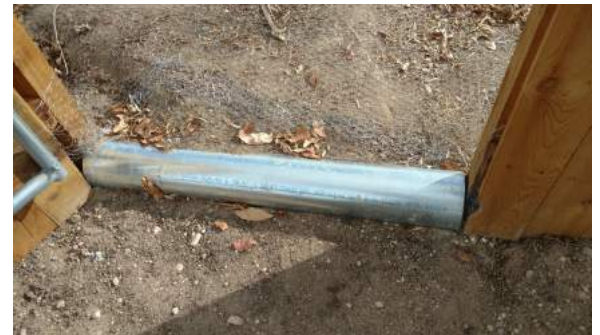
Add 6-inch diameter steel culvert pipe to seal bottom of gate. Note chicken wire abutting culvert pipe on prairie dog side of barrier to discourage digging under the pipe.