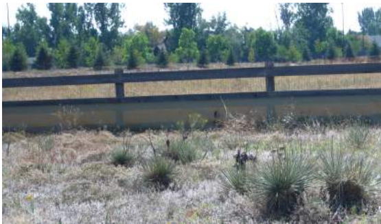
Non-prairie dog side

This multifunctional fence is used in many situations (parks, open space trails, fences along residential homes, and for containment of domestic pets) and can be modified to exclude prairie dogs. Using wood rails as both structure and to attach grommets (with a screw and washer) creates a good long-term barrier for prairie dogs. However, there are a few problems with this particular application (see below).