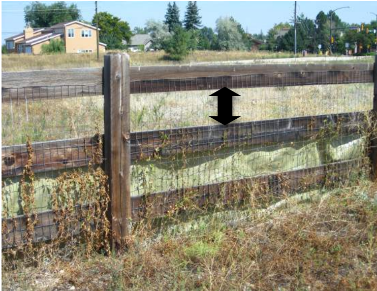
Prairie dog side