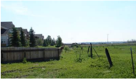
A. Townhomes next to colony (prairie dog side).