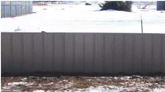
Non-prairie dog side of metal barrier.

Cons: Requires some experience for installation and there may be few or no experienced contractors in your area. Materials may be difficult to find. Repair is expensive (for example, if damaged with landscape or snow removal equipment). Can prevent water drainage. Requires trenching. Soil erosion next to barrier can create gaps, allowing prairie dogs to circumvent the barrier by unearthing soft dirt caused by trenching. Gaps can be filled in with sand and skirting installed if needed.