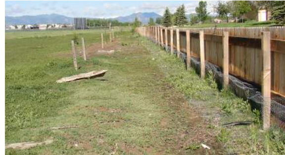
D. Long view.

Wood fences with gates: to inhibit light when the gate is closed, add 6-inch metal culvert pipe at the threshold and a vertical lip wood piece on gate.