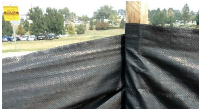
Modification: twist fabric around stake for longevity.