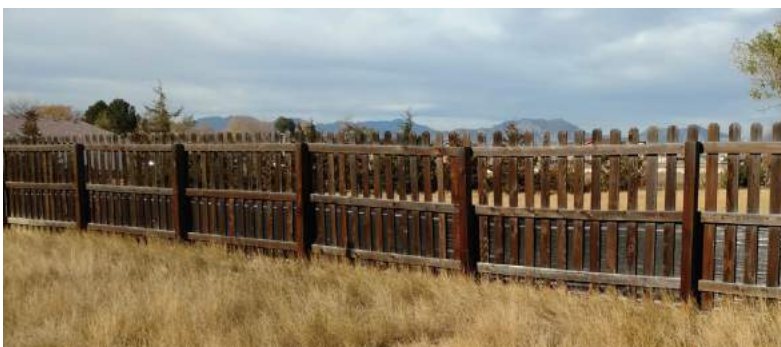
Exclusion area no longer prairie dog occupied.