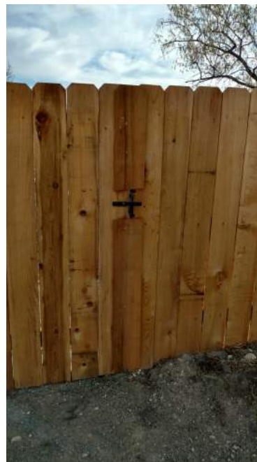
Overlay board at edge of gate so when closed there is no light penetration.